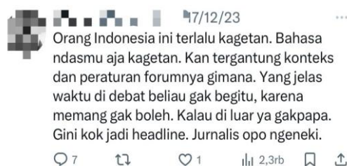
Figure 1. Positive Comment on Twitter

These comments clearly demonstrate support for Prabowo Subianto, both personally and in terms of acceptance toward emotional expressions in political discourse. In the context of expressive speech acts, such comments reflect that a portion of the public does not view the utterance as problematic and remains committed to supporting the leader of the Republic of Indonesia.