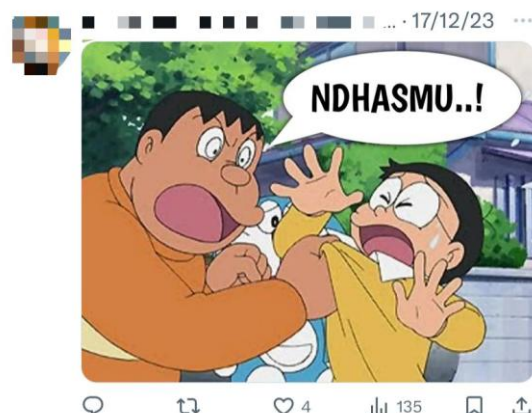
Figure 3. Meme on Twitter